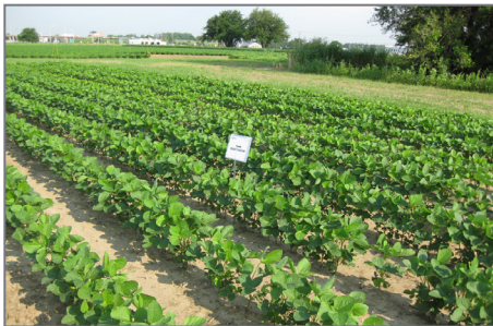
MONSANTO COLLINSVILLE, IL