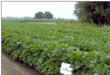
MONSANTO COLLINSVILLE, IL