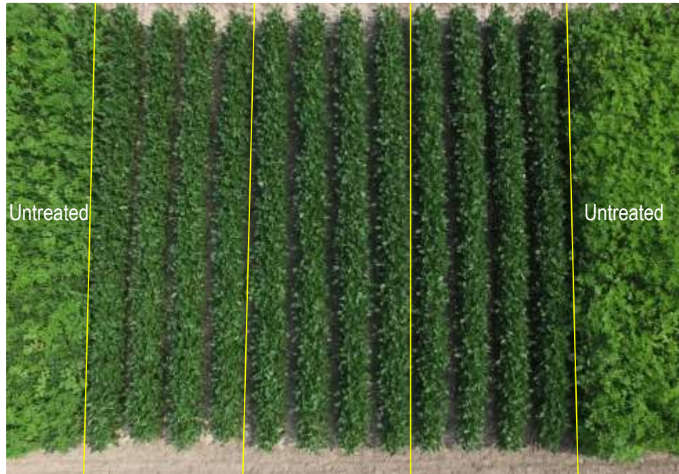
Roundup Ready 2 Xtend® soybeans