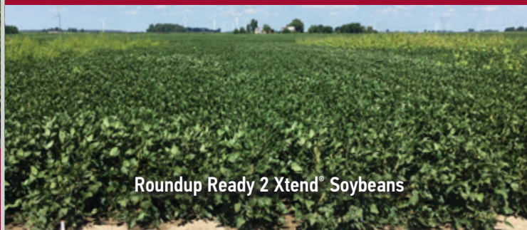
Roundup Ready 2 Xtend® Soybeans

Liberty® 280 SL Herbicide + Anthem® MAXX Herbicide + Amisol® Herbicide